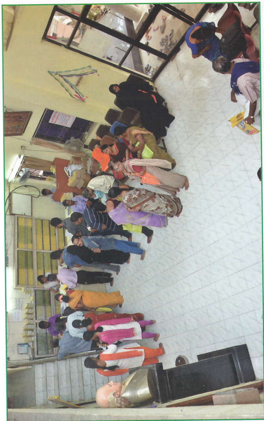
Out Patient Department