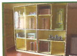
Community Medicine Department