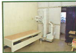
X-ray & Diagnostic Department