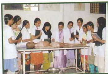
Anatomy Dissection Hall

A spacious and well equipped Library with a large paraphernalia of reference books in Homoeopathy and various medical journals is made available to the students.