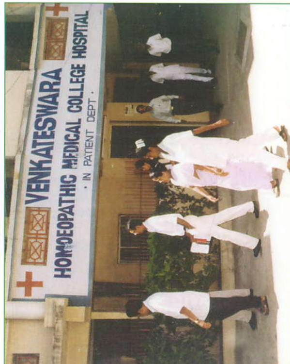
OPD & IPD entrance